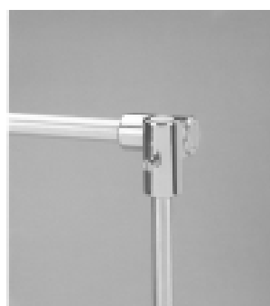
Rod End Connector