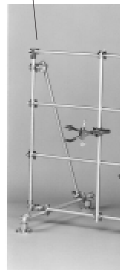
View of side support