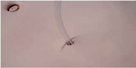
The PRO version also contains a suprapubic catheter on which care and cleaning can be practiced.

With the catheterization trainer, both male and female catheterization can be demonstrated, practiced and assessed. The interchangeable genitalia are anatomically correct and are made from realistic material. The foreskin and labia are soft and mobile, so that all the necessary hand movements can be practiced.